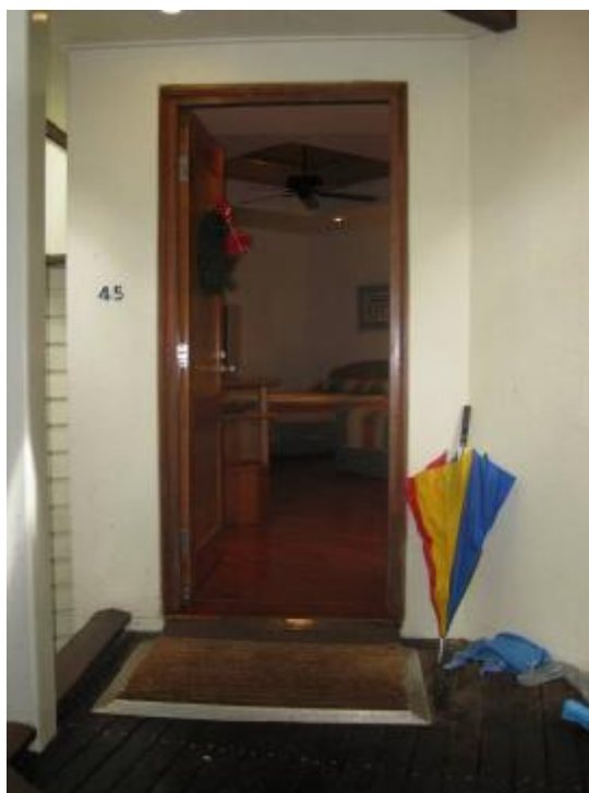
Entry into accessible room

Clearance beneath the beds from floor to bed base is only 100mm. Clearance through to the interconnecting room doors is 830mm. One of the doors is a fire door and a door wedge is required to hold it open, contact reception and they will provide one.