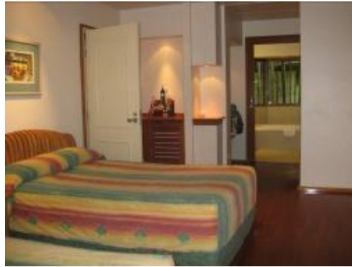
Looking through to accessible bathroom