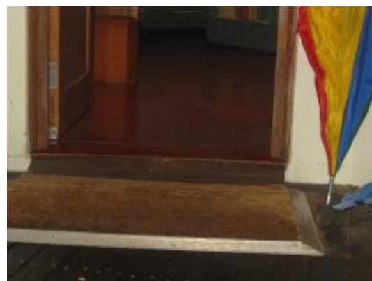
Timber door sill ramp