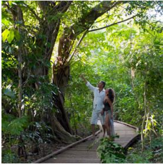
Boardwalks around the island

Overall the island is a very relaxing break; even if you are there as a day visitor you will enjoy the calming atmosphere of island life.