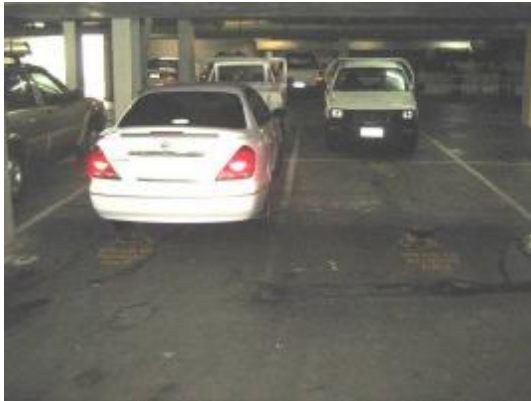
2 accessible car parks

There are two designated accessible parking bays which are underneath the building with a lift access to the upper floors. There is also a laundry which has a 100 mm step, but is quite roomy once inside.