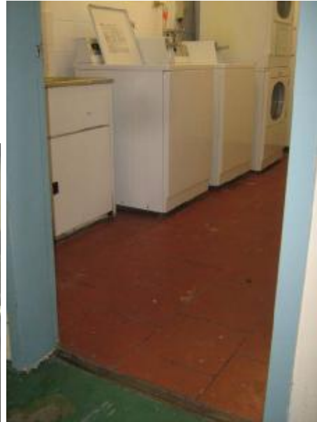
100 mm step into laundry