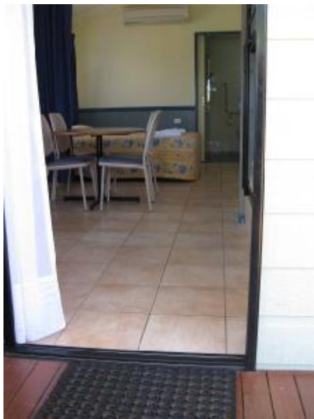
Entry into accessible cabin.

Room furniture can be moved to suit the guest's requirements, just notify staff when booking and they will be more than happy to assist. The double bed can be turned 90 degrees to suit your needs and achieve greatest access.