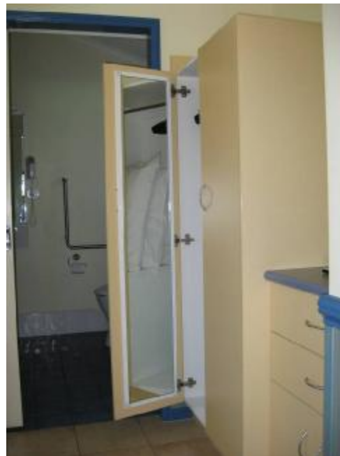
Clothes hanging space