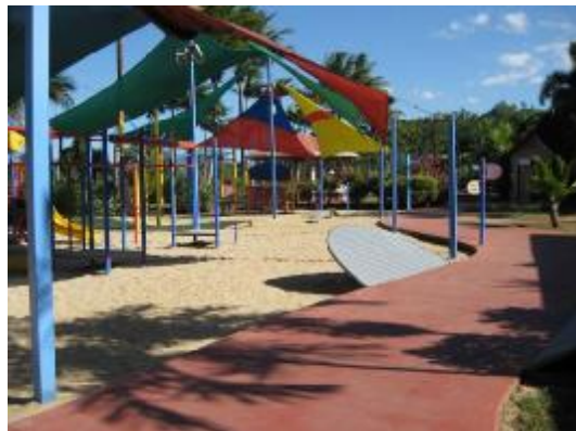
Kids Adventureland and Bike Track