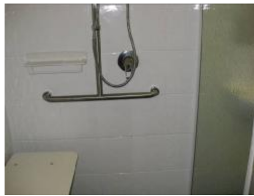
(note clearance between seat and screen)