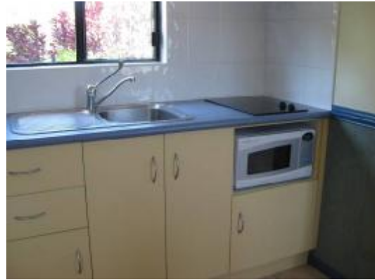
Kitchenette and lowered microwave