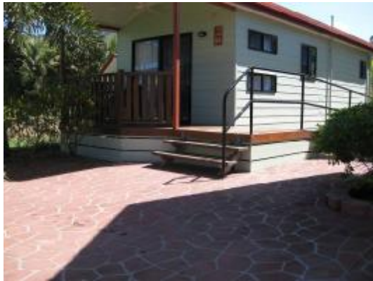
Accessible cabin and car park

There are three accessible cabins located in the resort. Access into the cabin is up a ramp located next to the parking area. The door width is 890mm clear opening. The doors are light and easy to slide open and little force required to slide the doors open. Entry into the cabin is over a level threshold, the floor surface is a well laid tiled area. The cabin contains a queen size bed, two bunk beds for a larger family or carer.