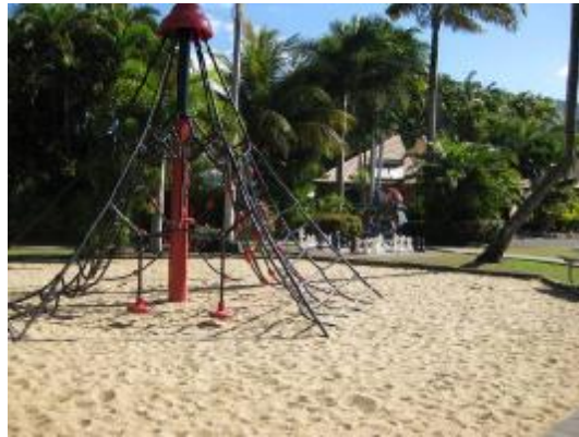
Activity area with giant chess set.