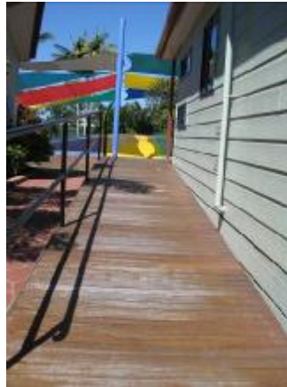
Ramp leading from car park

Room furniture can be moved to suit the guest's requirements, just notify staff when booking and they will be more than happy to assist. The double bed can be turned 90 degrees to suit your needs and achieve greatest access.