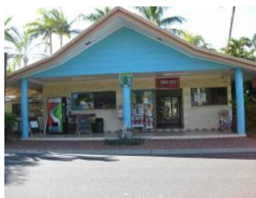
Mini Mart (note steps)