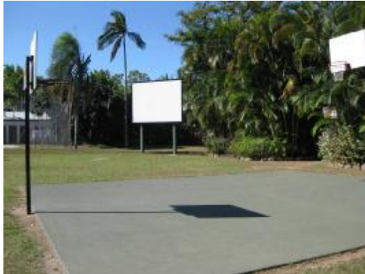
Outdoor cinema and basket ball

Recreation Building is accessible with level access to table tennis and pool tables. There is a TV room and Video room with a small sliding door track threshold. The outdoor cinema and small basket ball court is located next to the recreation building. The toilet block only has conventional toilets and there is a small threshold into the laundry. The mini golf located next to the recreation building is not accessible due to the gravel used in the landscaping.