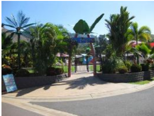
Sun Lagoon entry

to all visitors but those who are able to transfer or walk short distances may be able to access the pool. There are tables, chairs and a BBQ hut available in the Lagoon area.