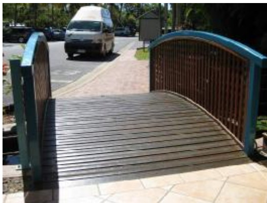
Entry into reception over raised bridge.

The park Mini Mart has two low steps up, the resort will provide a small ramp to give access into the shop. Please let staff know you will require the use of the ramp.