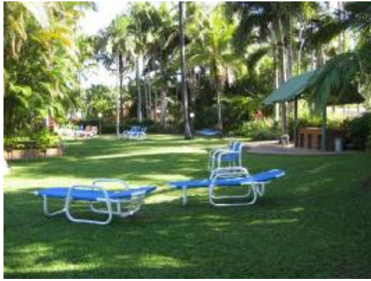
Garden Pool grounds