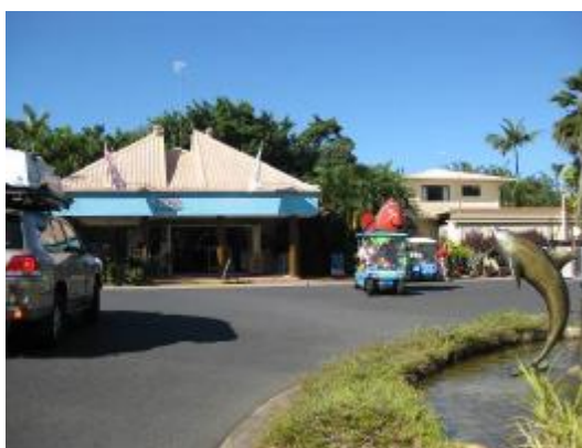
Reception's rear access