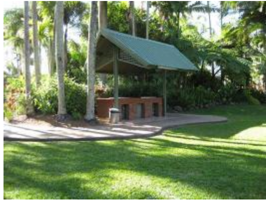
BBQs in Garden Pool grounds, note step up onto slab from pool grounds.

The Kids Adventureland and bike mania track is easily accessible from the cabins and camp grounds. Not all play equipment is accessible due to sand soft fall. The bike track is accessible and leads to an accessible toilet block located conveniently between the playground and tennis courts.