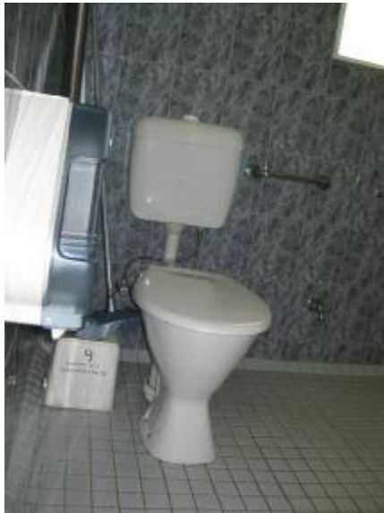
Accessible Camp Toilet

convenience. Horizontal and vertical grabrails are provided. The sink is 780mm from floor to top of sink and has an underside clearance of 650mm.