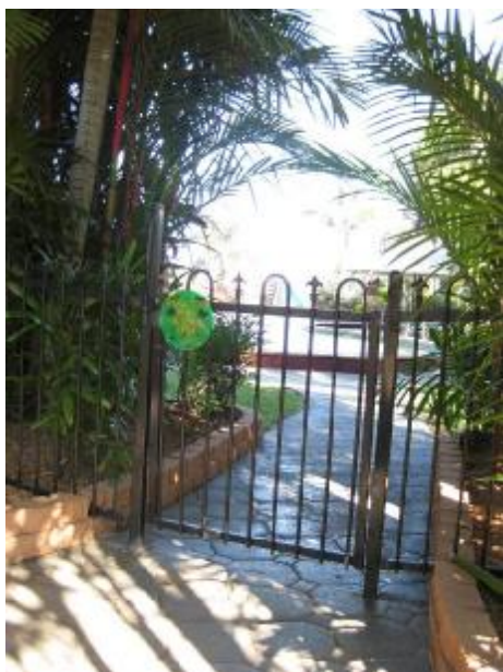
Entry into Garden Pool

The Garden Pool area has a good level access path leading from the recreation building. The pool will not be accessible to all guests. The BBQ area is accessible with some assistance up into the BBQ hut area.