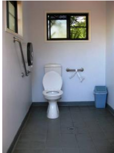
Accessible toilets, Kids Adventureland

Recreation Building is accessible with level access to table tennis and pool tables. There is a TV room and Video room with a small sliding door track threshold. The outdoor cinema and small basket ball court is located next to the recreation building. The toilet block only has conventional toilets and there is a small threshold into the laundry. The mini golf located next to the recreation building is not accessible due to the gravel used in the landscaping.