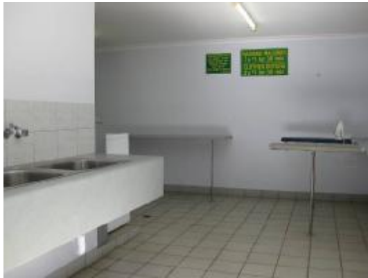
Laundry rec building