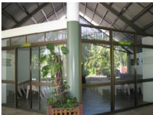
TV and Video rooms