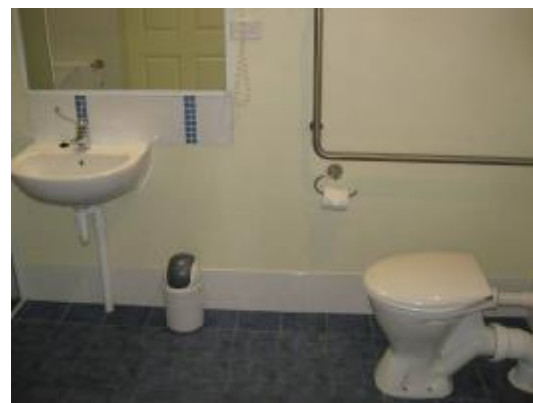
(note clearance from front of pan to sink)