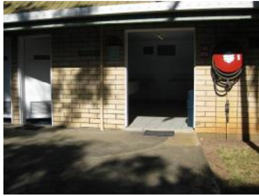
Conventional toilets Rec building